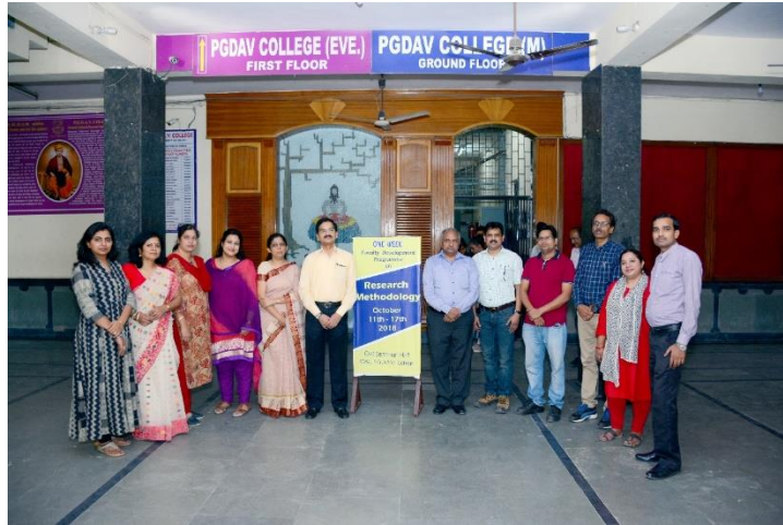
TEAM IQAC PGDAV COLLEGE